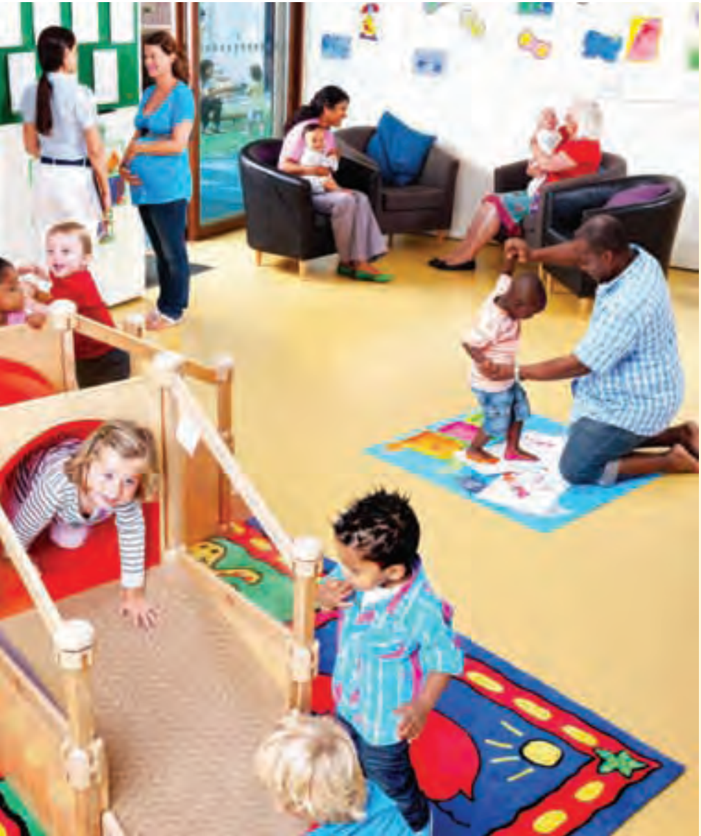
The Sure Start initiative. By mid-2009 more than 3,000 Sure Start centres had been established across the UK