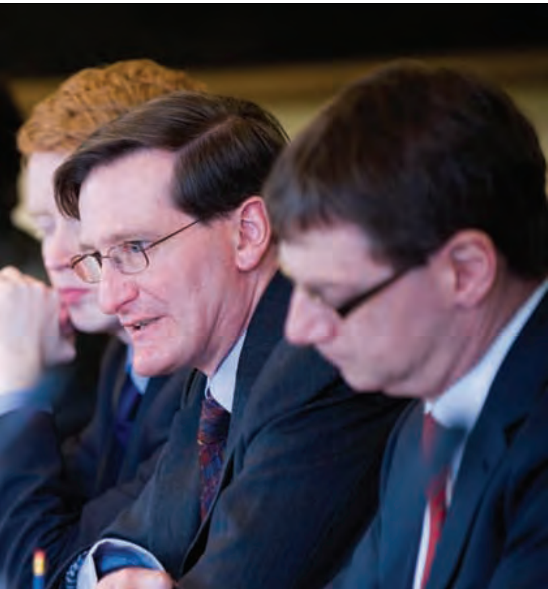
Dominic Grieve MP leading a British Academy Forum on human rights legislation, March 2010