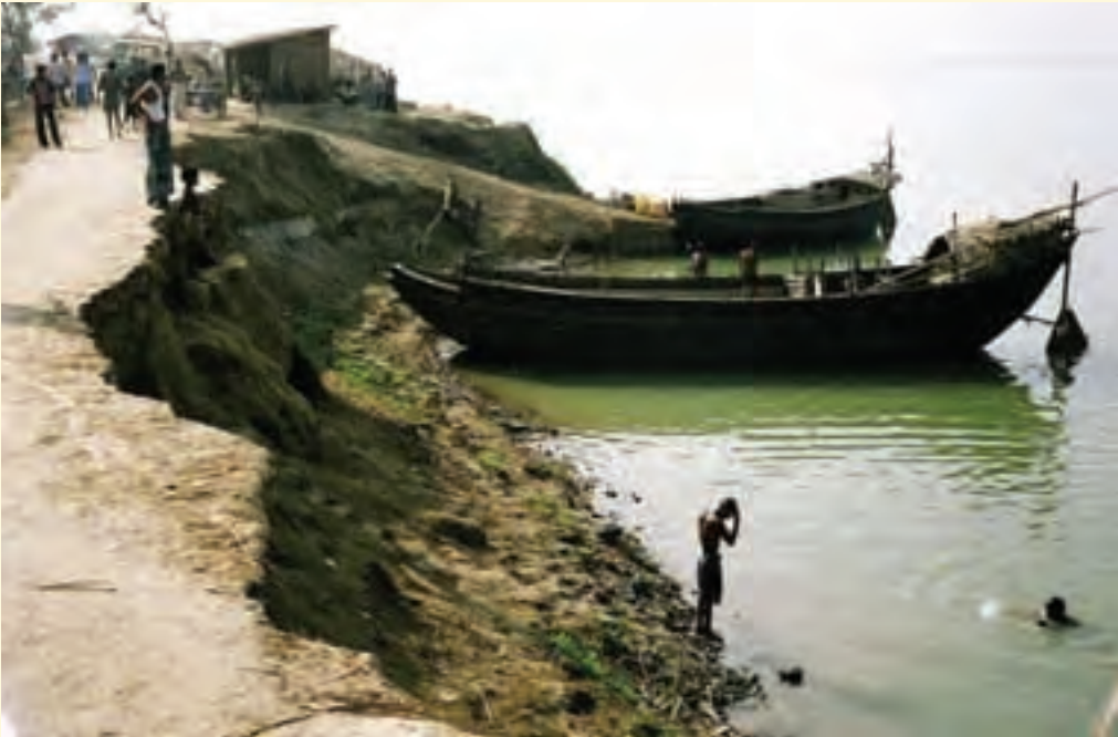
A collapsing road in the Bengal Delta

Long term research relationships and collaborations with overseas partners can also bring economic benefits. For example, British research in archaeology and environmental impact supported by the Society for Libyan Studies has recently facilitated the contacts and goodwill necessary to generate more than £1 million of commercial contract work in Libya for UK companies. 100