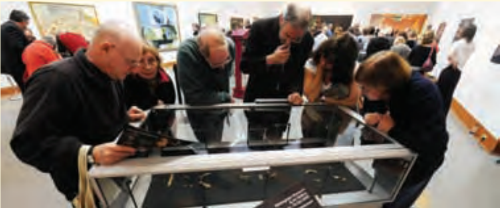
The Staffordshire Hoard on display in Birmingham Museum and Art Gallery, November 2009

Over the last decade, the pivotal economic importance of the creative, cultural and media industries – and the role that arts, humanities and social research plays in fuelling and sustaining them – has been recognised by the European Commission, the World Bank, and national and local governments. Their importance is likely to increase as changing social trends result in heightened demand for leisure activities.