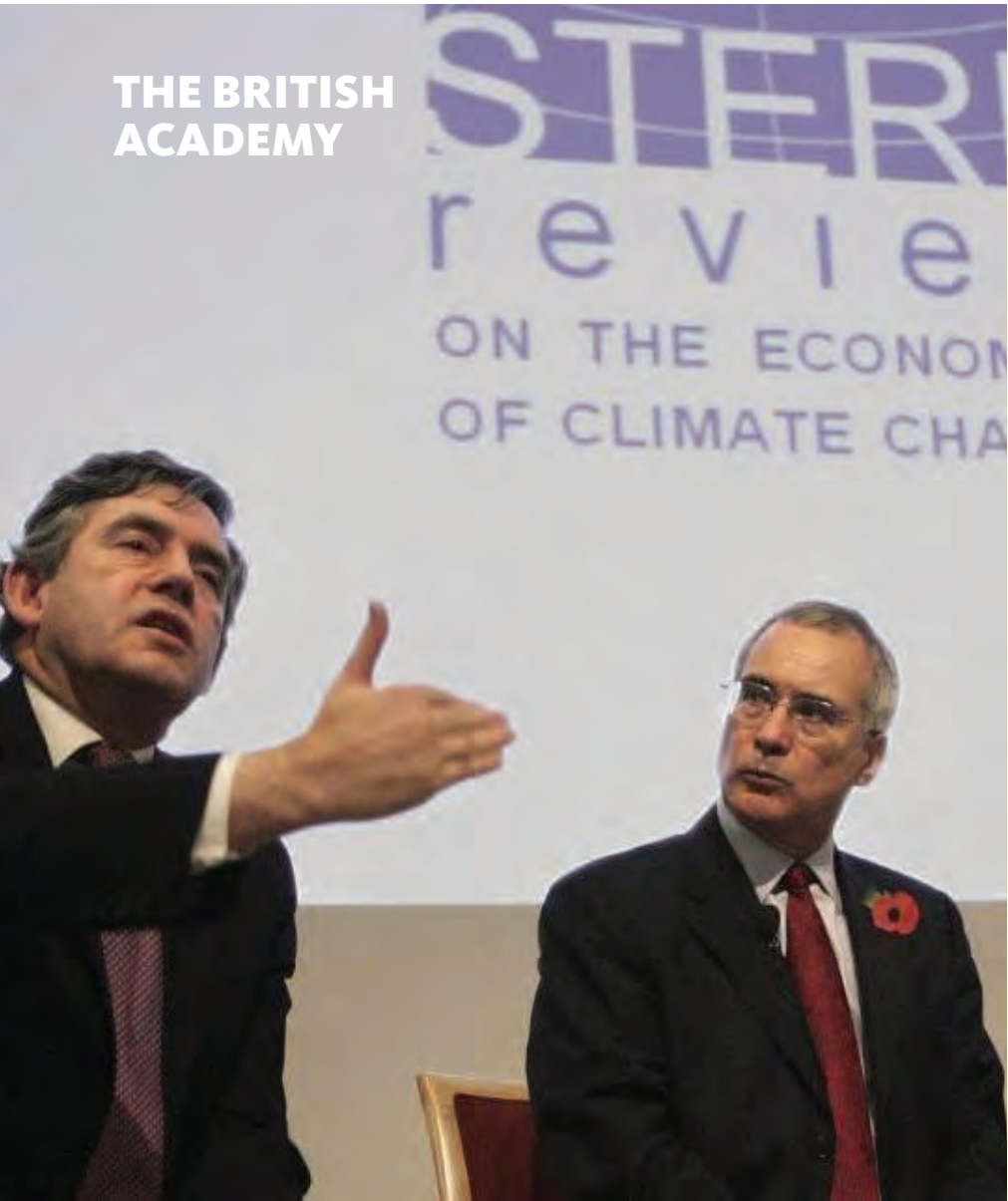
Sir Nicholas Stern FBA (now Lord Stern), launching his seminal review of The Economics of Climate Change with Chancellor Gordon Brown, October 2006