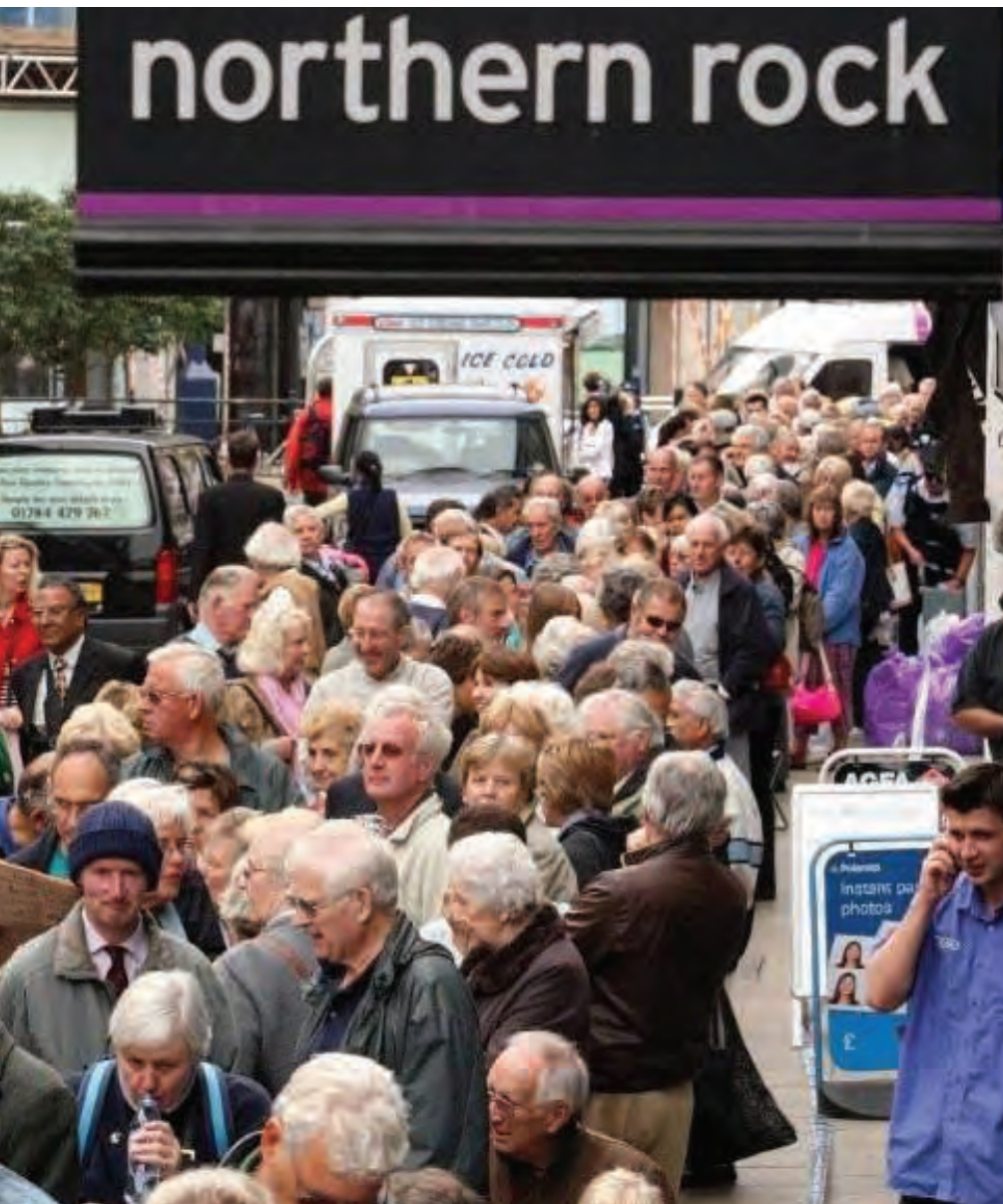
Northern Rock collapse, September 2007. Customers wait in line to remove their savings